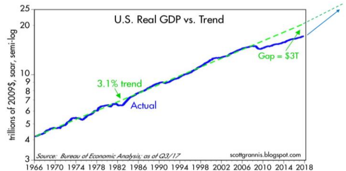
Graph 1. U.S. Real GDP Growth Returning to Long-term Trend

One encouraging sign pointing to the sustainability of the significant improvement in economic growth is small business optimism, which is currently at the highest level in 40 years. This new optimism is starting to show up in job creation as small businesses have added 2.9 million net new jobs so far this year compared to just 2.3 million at this point in each of the last two years, an increase of 96k net new jobs per month (see Graph 2). This is very encouraging as small businesses are the backbone of the U.S. economy, accounting for around half of all jobs and nearly two-thirds of all jobs created. We expect small business optimism to continue to drive higher levels of job creation and economic growth as they continue to increase investment in their businesses following years of under investment.